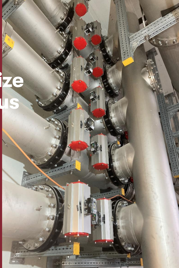
Pneumatically operated Wey butterfly valves TF20 DN 400

The cooperation with the planning office and the customer has been extremely positive. Despite the limited production capacity and the significant coordination effort, all valves could be delivered and installed on time.